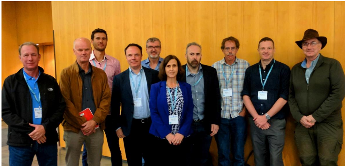
EPICS council members at ICALEPCS 2017